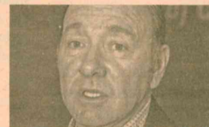
KEVIN SPACEY Disgraced American actor