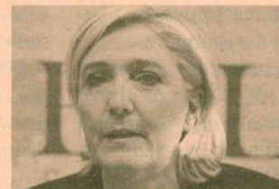
MARINE LE PEN French politician