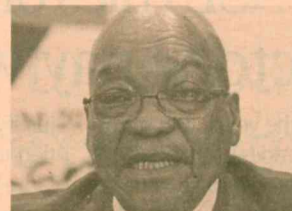
JACOB ZUMA South African President